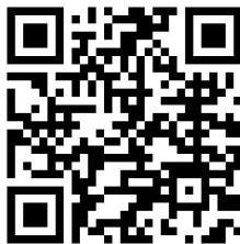
Wastewater Treatment Operator Survey

https://www.research.net/r/wastewatercollection